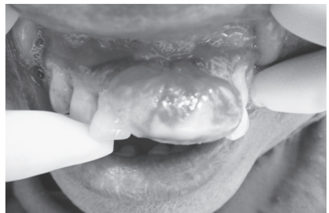
Fig. 1: Clinical case presentation of fibrolipoma

The initial report of oral lipoma was provided in 1848 by Roux in a review of alveolar masses which he referred it as a