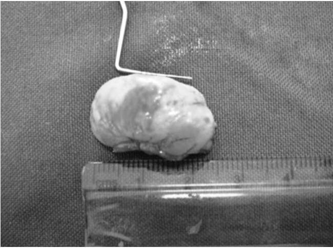
Fig. 2: Excised lesion