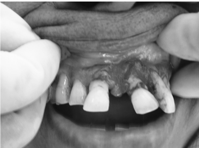
Fig. 4: Postoperative

'yellow epulis'. 12 The lipoma is a very frequent benign tumor of adipose tissue, but its presence in the oral and oropharyngeal region is relatively uncommon with a prevalence rate of only 1/5000 adults. 1 Fibrolipoma is a microscopic variant of lipoma characterized by a significant fibrous component intermixed with lobules of fat cells. The consistency of this lesion varies from soft to firm, depending on the quantity and distribution of fibrous tissue and the depth of the tumor. 13 The tumor has been reported to be more frequent in the buccal mucosa and buccal vestibule, and it also shows a slight predominance in females. 10 Hereditary, fatty degeneration, hormonal basis, trauma, infection, infarction and chronic irritation are probable representative theories to elucidate the pattern of a lipoma. A number of microscopic variants have been described. The most common of these is the fibrolipoma, characterized by a significant fibrous component intermixed with the lobules of fat cells. The angiolipoma consists of an admixture of mature fat and numerous small blood vessels. Myxoid lipoma exhibits a mucoïd background and may be confused with myxoid liposarcomas. The spindle cell lipoma is another variant that demonstrates variable