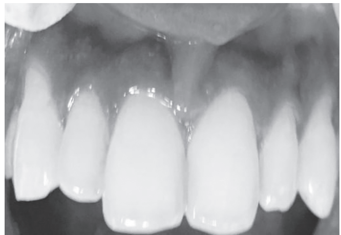
Fig. 4: Preoperative view (Case 2)