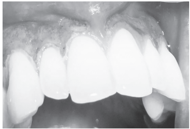
Fig. 6: Immediate postoperative view (Case 2)