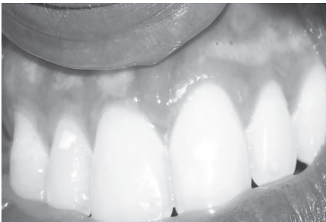
Fig. 7: Postoperative view after 3 month (Case 2)

common problems associated with dental esthetics and there are a variety of procedures to correct this condition. Melanin is found in the basal and suprabasal layer of epithelium produced by melanocytes; hence, the removal of epithelium is required to correct this condition. 4