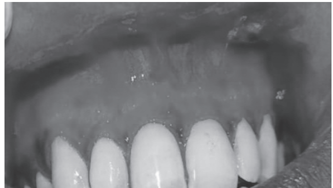
Fig. 2: Surgical view (Case 1)