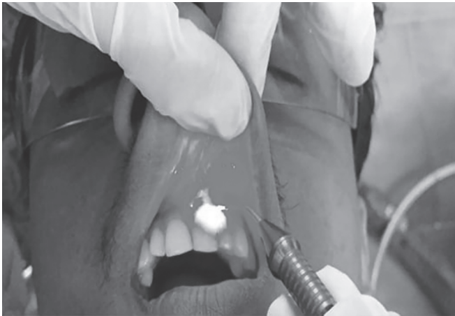
Fig. 5: Surgical procedure using diode laser (Case 2)