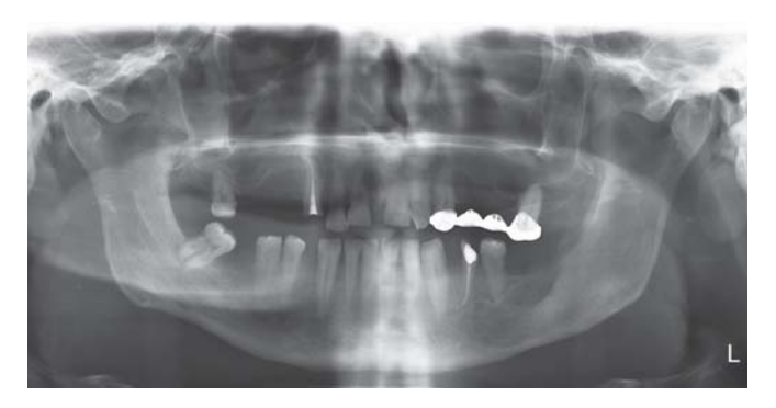
Fig. 3: Panoramic view of the lesion after 2 years