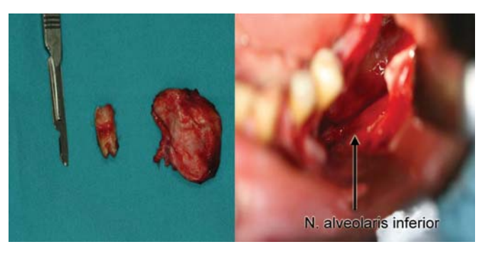
Fig. 2: View of the cyst, impacted tooth and alveolaris inferior nerve at the base of the cyst cavity