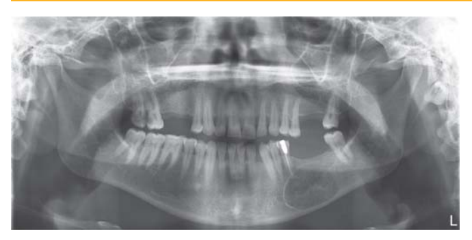
Fig. 3. Postoperative follow-up radiography after 20 months. Control radiographs of the region increase radiopacity in surgical area were observed

findings are improving paresthesia, were not lost completely. The patient continues periodic checks.