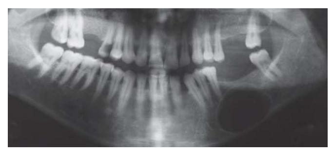
Fig. 1: Radiological examination revealed a large unilocular radiolucent lesion. Histopathological examination confirmed the diagnosis as schwannoma

The patient is still under our follow-up for 20 months (Fig. 3). Control radiographs of the region increase radiopacity in surgical area were observed. Although the