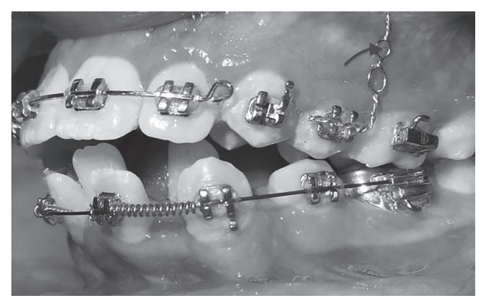
Fig. 2: Guide secured in place using module on premolar bracket