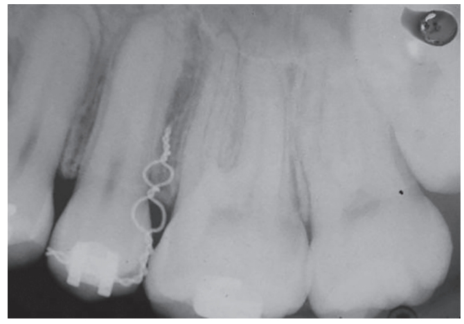
Fig. 3: Intraoral periapical radiograph prior to implant placement

center of the loop will help to locate the exact point of implant placement.