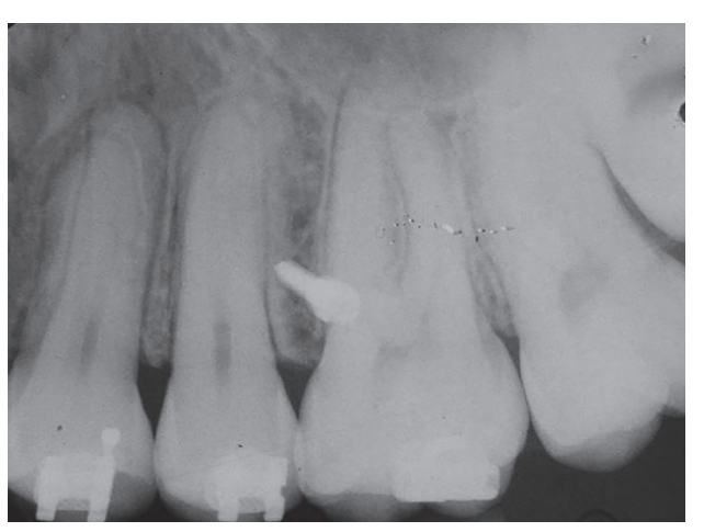
Fig. 4: Postimplant placement IOPA radiograph

In order to reduce chances of root damage, implant can be placed above the apex of roots in maxillary arch. But even though such site of placement is good for intrusive forces, they are not efficient for horizontal forces.<sup>6</sup> Implant placement between roots ensures horizontal component of force.<sup>6</sup> According to a recent study,<sup>7</sup> there is more failure risk if the implant is placed close to the roots. The quality and quantity of bone at the implant site, the geometry of the implant, and the method of site preparation determine the initial stability of the implant at its placement.<sup>8</sup>